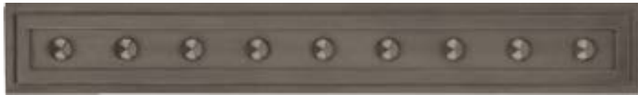
ULLY Pewter Dot Liner 1 7/8"x13"