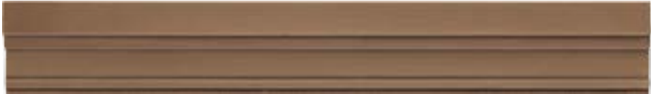
ULLM Bronze Chair Rail 1 7/8"x13"