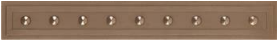
ULLX Bronze Dot Liner 1 7/8"x13"