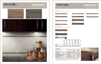
Description: Metal Mania™ Product Overview Size: 8½" x 11"