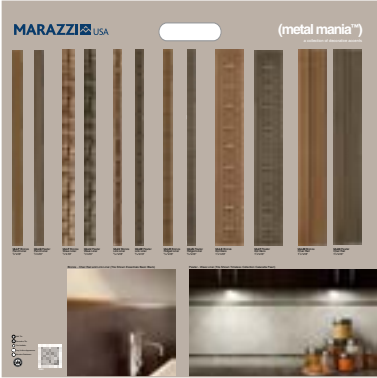
Description: Z560 Metal Mania™ Illustrated Sample Board Size: 25"x 25"