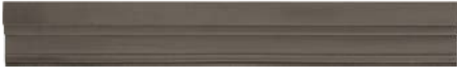
ULLN Pewter Chair Rail 1 7/8"x13"