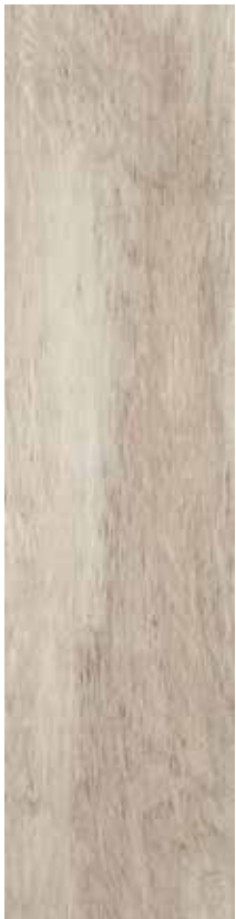
MH2S Africa 12"x48" Rectified