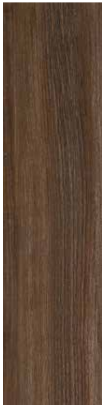
MH2P Americano 12"x48" Rectified