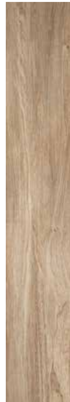
MH2U Francese 8"x48" Rectified