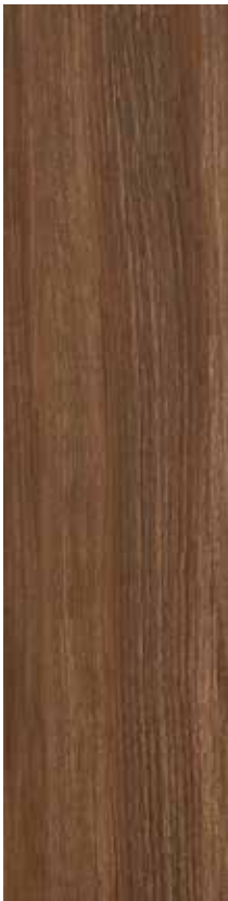
MH2M Italiano 12"x48" Rectified