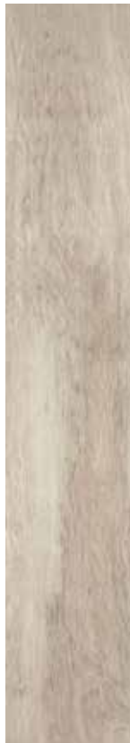
MH2Y Africa 8"x48" Rectified