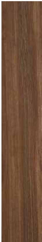
MH2T Italiano 8"x48" Rectified