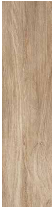
MH2N Francese 12"x48" Rectified