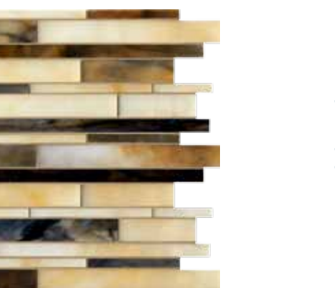
UJ9V Olive Oxfords Random Mosaic 12"x12"