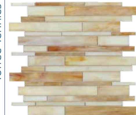
UJ92 Toffee Tennies Random Mosaic 12"x12"