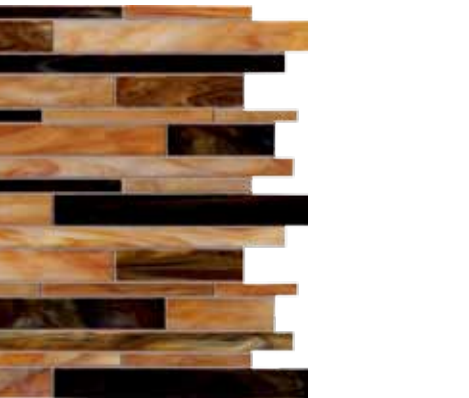
UJ9T Chocolate Clog Random Mosaic 12"x12"