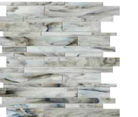
UJ9X Smokey Stiletto Random Mosaic 12"x12"