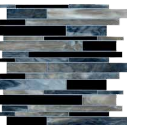
UJ9Z Steel Toe Random Mosaic 12"x12"