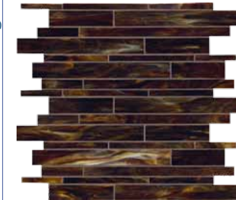
UJ93 Walnut Wedge Random Mosaic 12"x12"