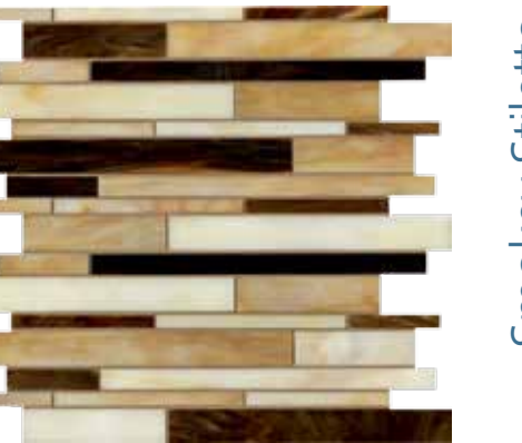
UJ9W Pecan Pump Random Mosaic 12"x12"