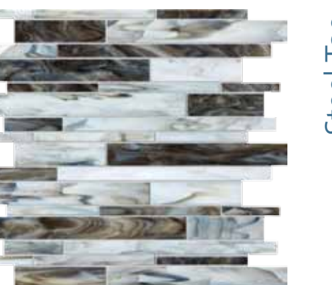
UJ9Y Sable Slipper Random Mosaic 12"x12"